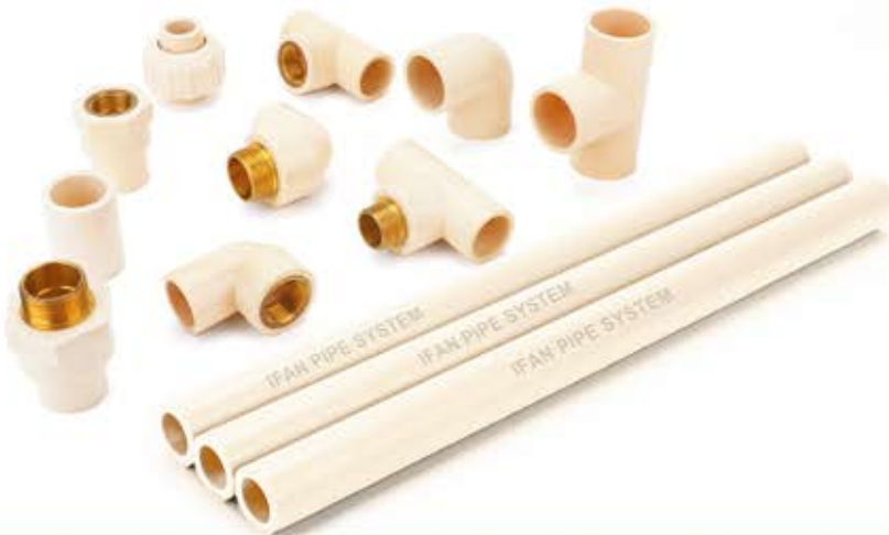
CPVC ASTM2846 SYSTEM (501)