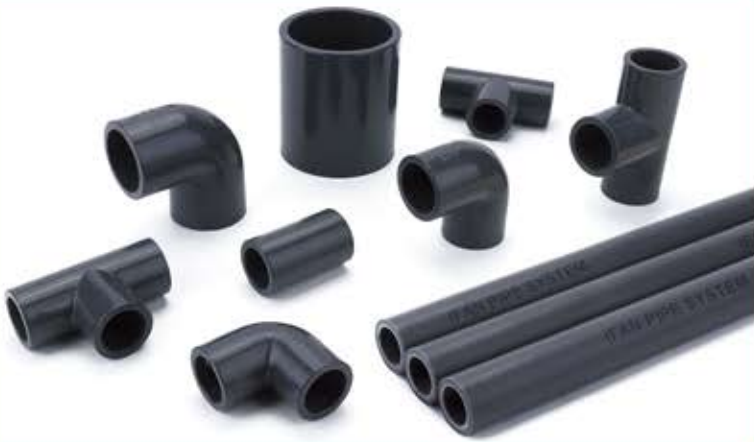
UPVC SCH80 SYSTEM (803)