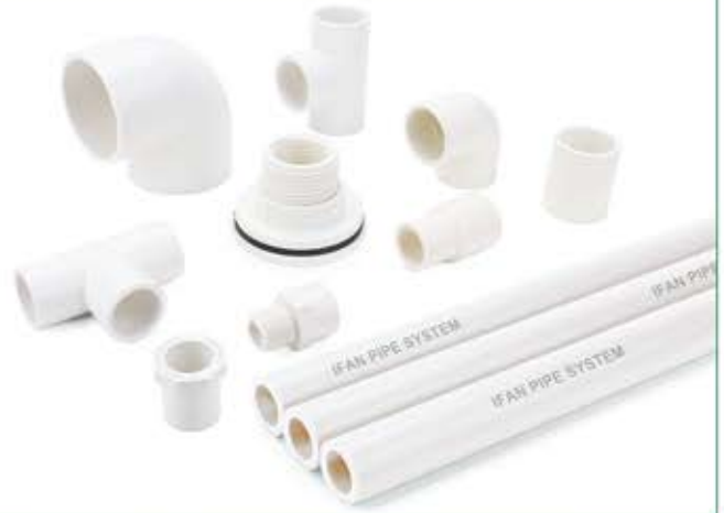
UPVC SCH40 SYSTEM (802)