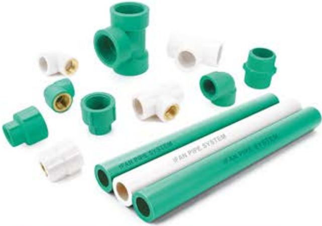
UPVC BST THREAD FITTING SYSTEM (801)