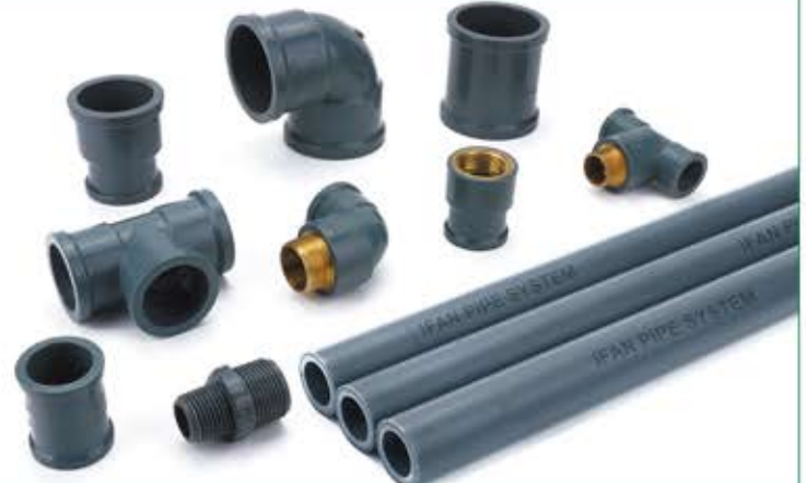
UPVC DIN SYSTEM (804)