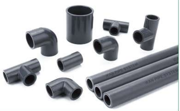
UPVC GB PN16 SYSTEM (806)