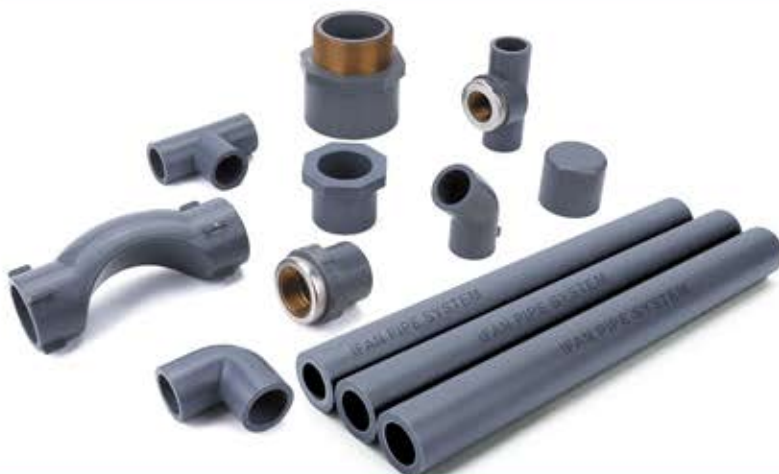
CPVC SCH80 SYSTEM (503)