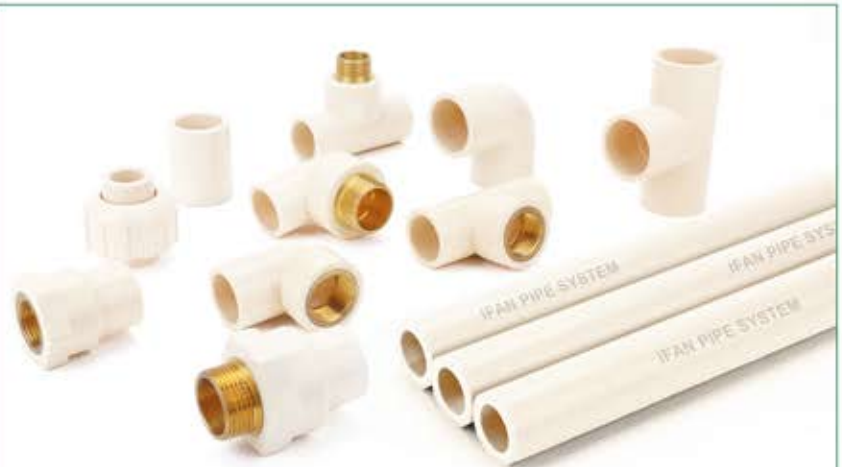
CPVC DIN SYSTEM (502)