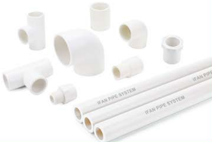
CPVC GB PN10 SYSTEM (805)